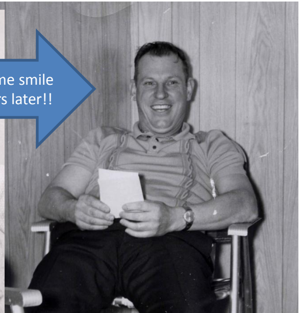
July 16, 1967 Economy Run, Hamilton T.P. School