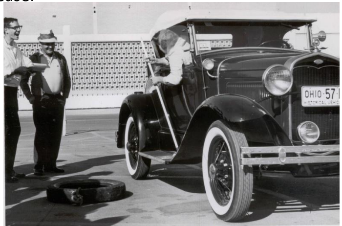
Contest Meet at Northland Shopping Center Oct 13, 1968

Lancaster Flea Market June 1, 1969 Question # 1. Why Do People Go To The Flea