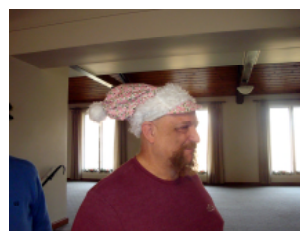
Gotta love the hat!