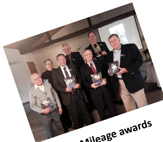
High Mileage awards