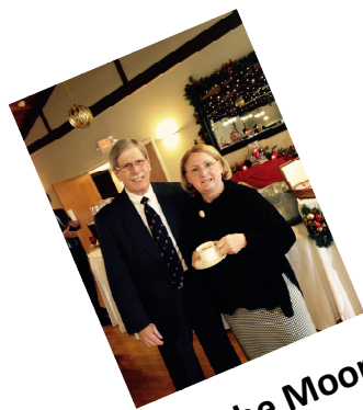
Party with the Moores