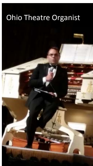
Ohio Theatre Organist