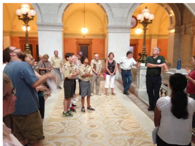
State House Tour