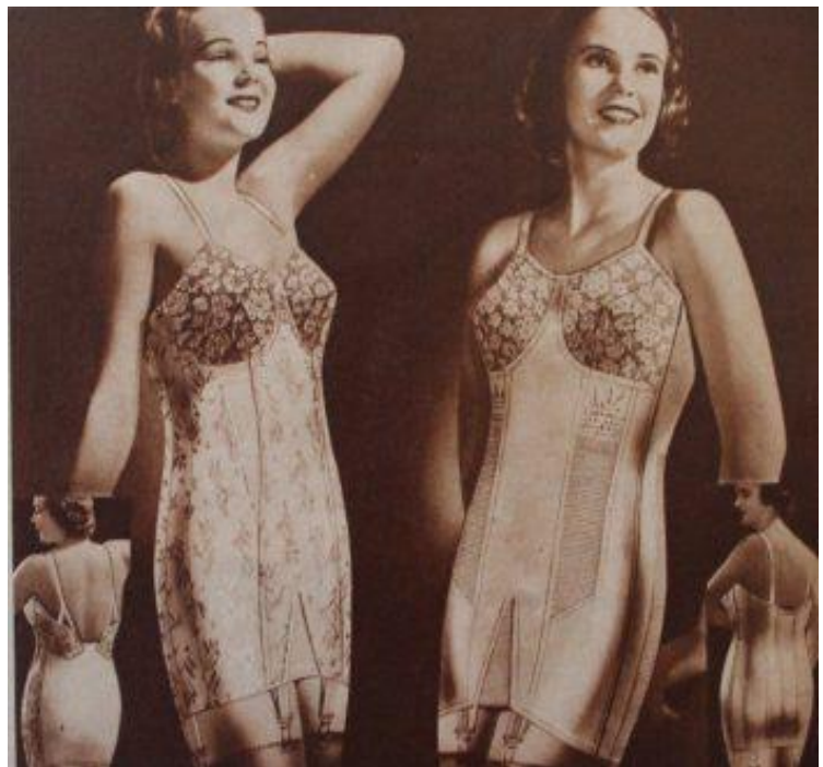
Lastix Corselets helped women achieve the look that they desired in the 1930's.