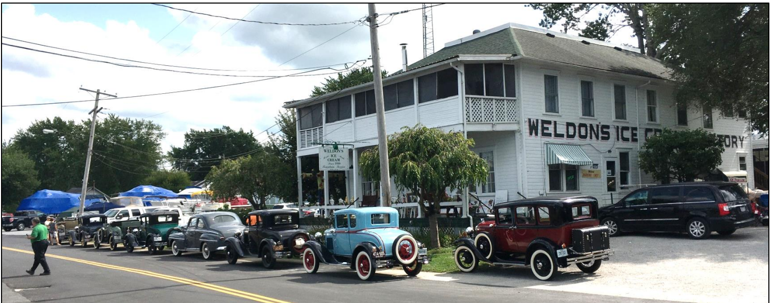
Time for ice cream!