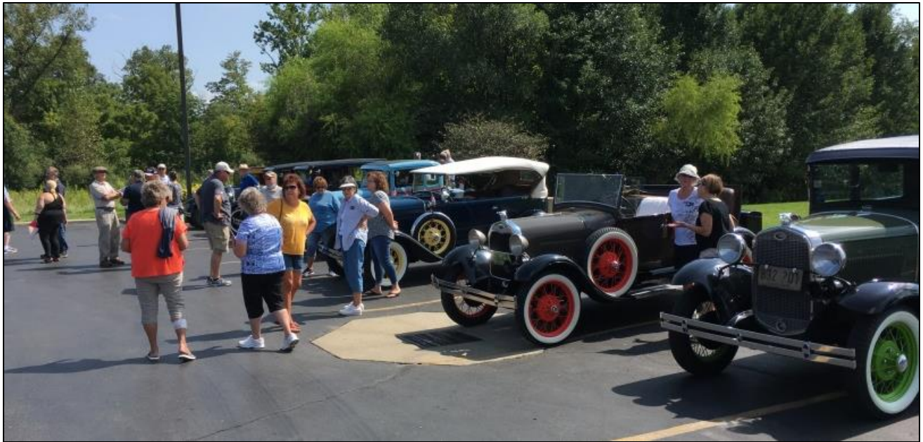
Club Members on the east side of Columbus getting ready to head to Kirkersville.