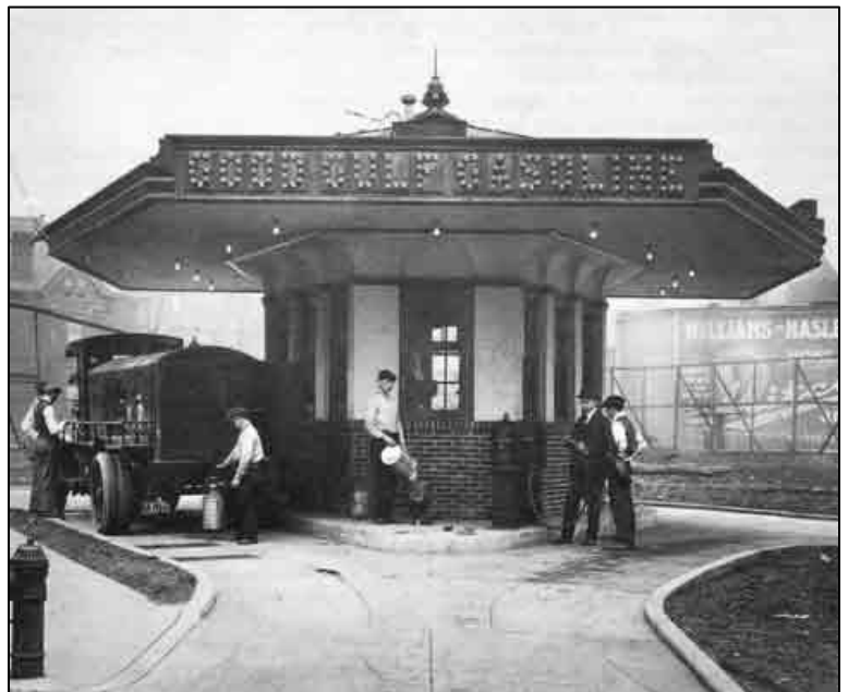
The first drive-in gas station.