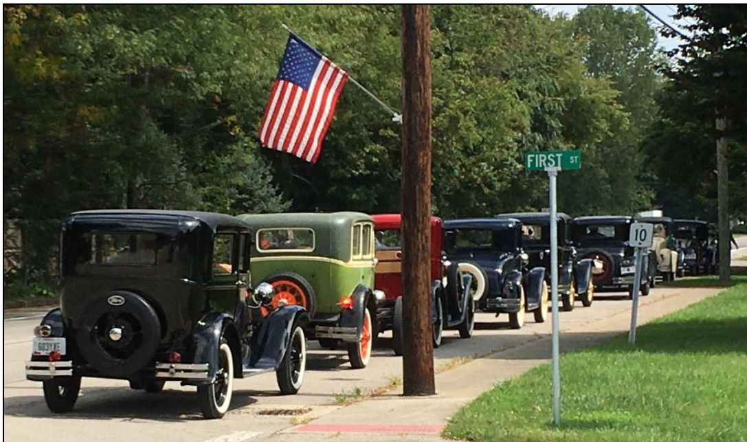
The front half of the group pulling out of Kirkersville.