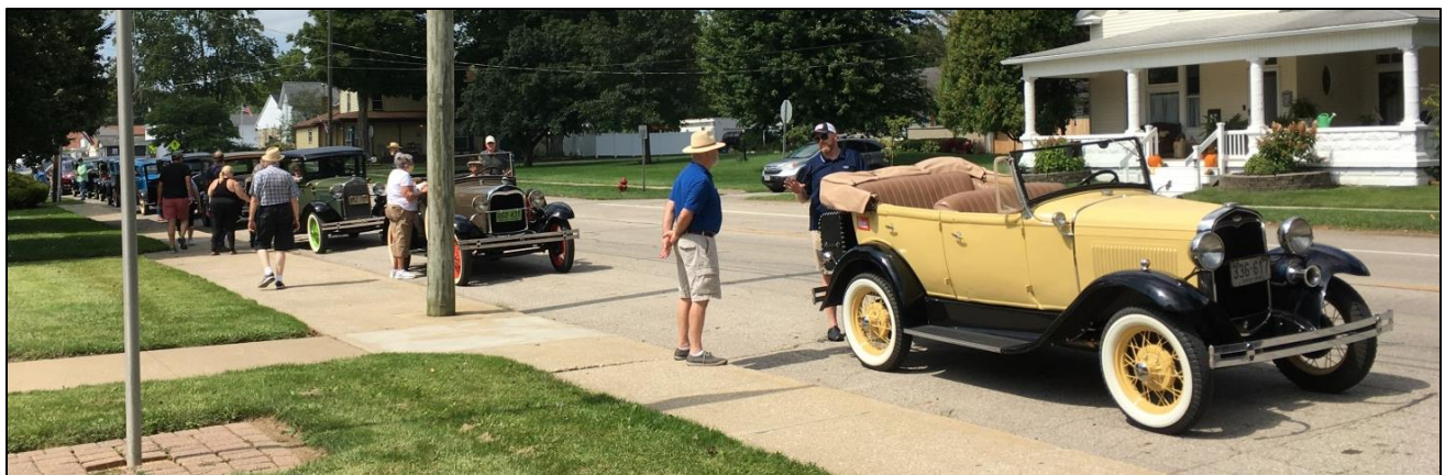
Stretching our legs in Kirkersville.