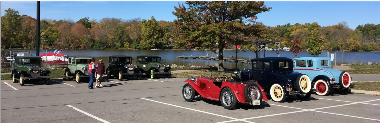
Some of our club members' cars parked along the Scioto River at Griggs Reservoir Park.

Although the weather was a little chilly, it was a beautiful fall day. Between the bright sunshine and the backdrop of the amazing fall colors, we were given the unique opportunity to take some wonderful pictures of our cars. We had a great turnout with 22 members and 12 antique vehicles in attendance. Our next meeting will be held on the 7 th of November at Harbage’s Farm located between Plain City and West Jefferson. With a little luck from the weatherman, it could be another beautiful day as well. Either way, it’s always a good time at his place. See you in November!