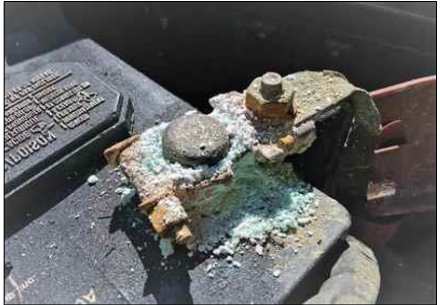
By: Bruce Haynes Old Dominion Model "A" Ford Club

Clean grounds & battery terminals are always important. Don't forget to loosen the starter from the block and polish the block & all starter mating surfaces with sandpaper to insure a good electrical ground. Copper washers and bare metal on the positive battery cable connection to the frame, plus an additional strap that goes to a bolt on the transmission will help grounding issues. And, engine side pans not only help with engine cooling, they help with grounding as well.