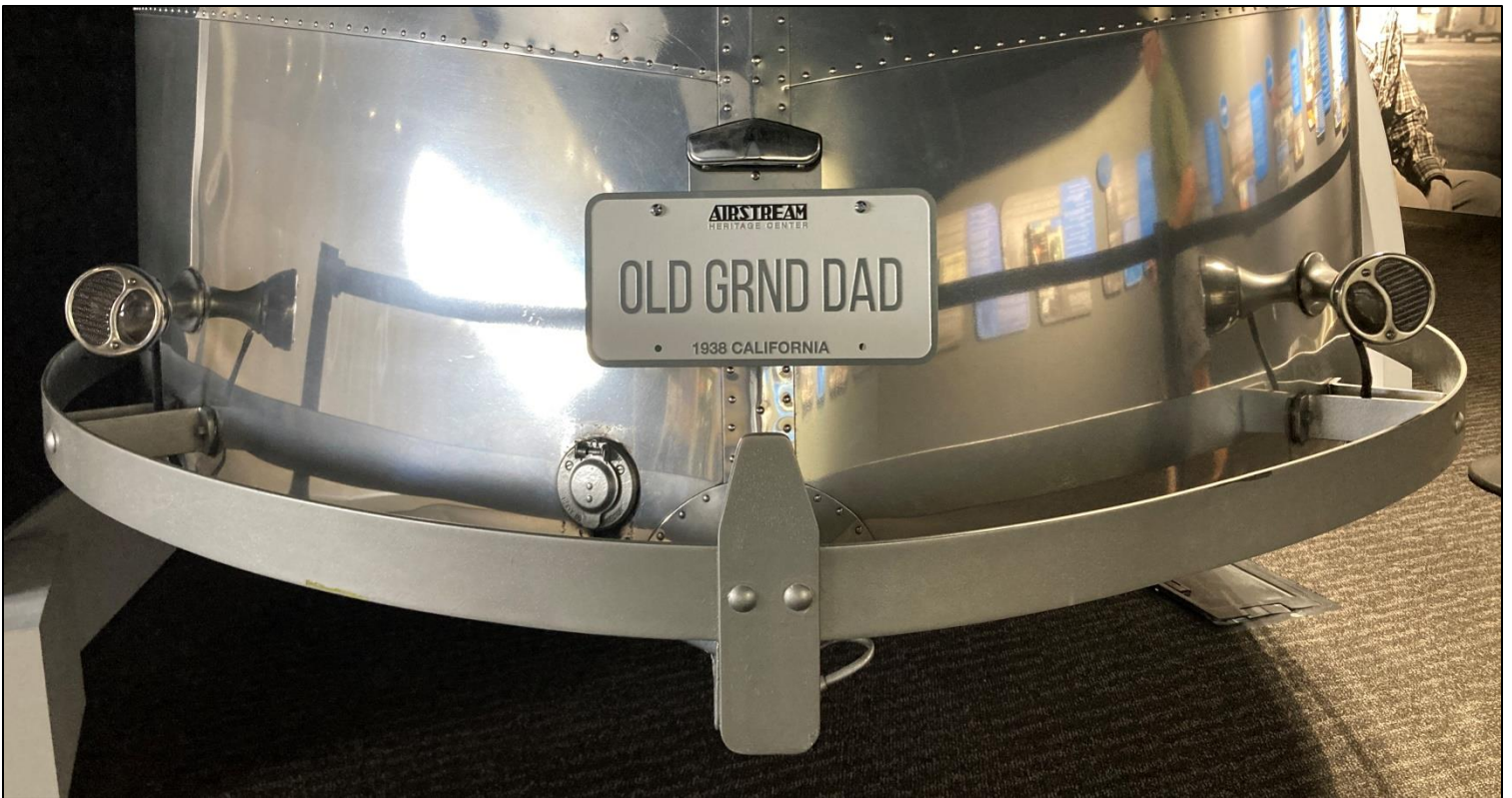
Here is a close-up of the rear of a 1938 Airstream trailer. Check out the tail lights! Look familiar?