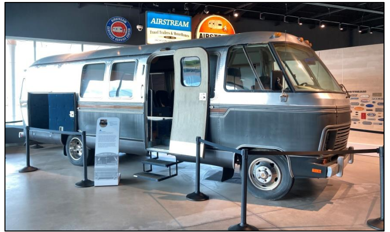
Airstream also builds specialty vehicles such as this funeral hearse. The family rides in the front and the deceased is placed in the rear door.