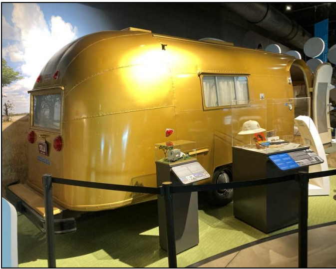
Not all Airstreams were silver!