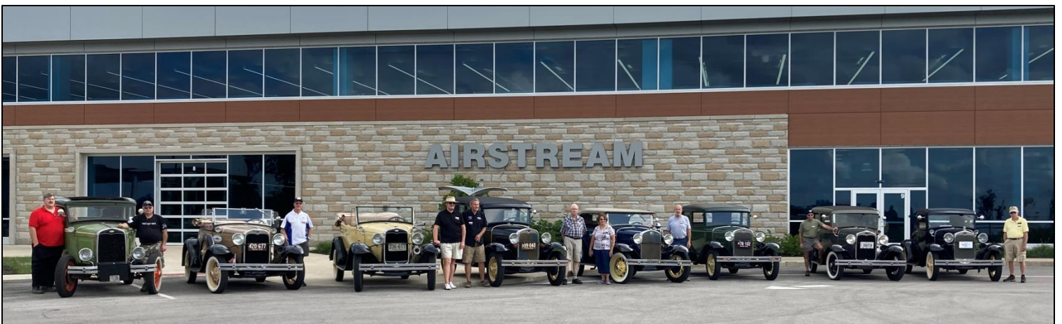
Here are a few of the club members that joined the tour.