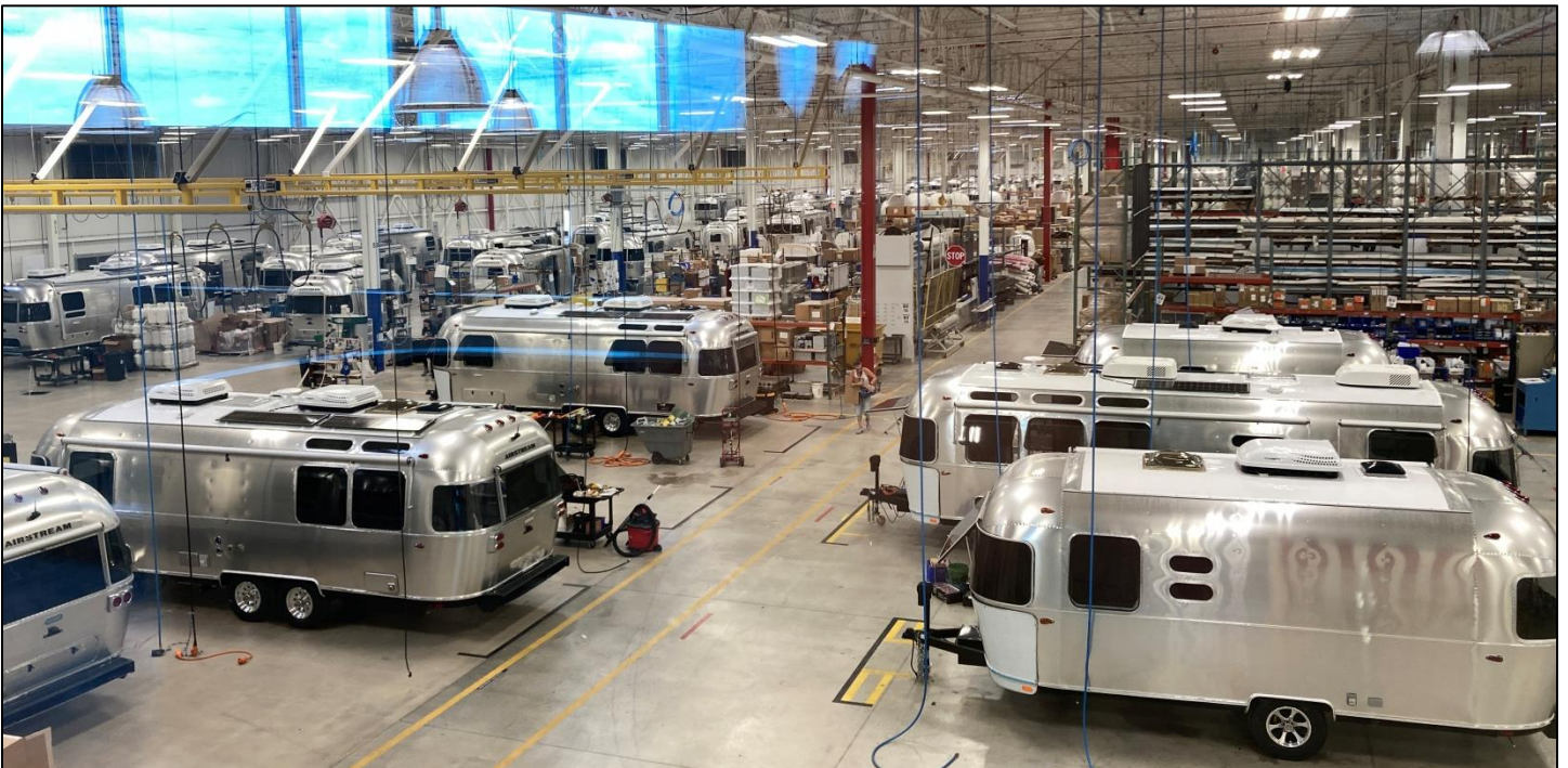
A view of the factory floor at the Airstream facility in Jackson Center, Ohio.