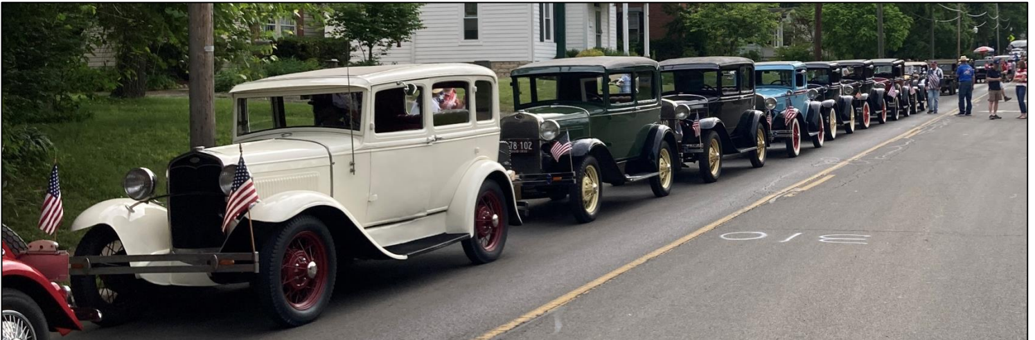
Our Model "A"s lined up and waiting for the parade to begin.