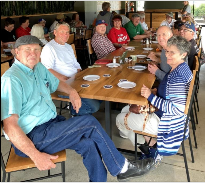
Lunch time at Little Italy in Groveport, Ohio.