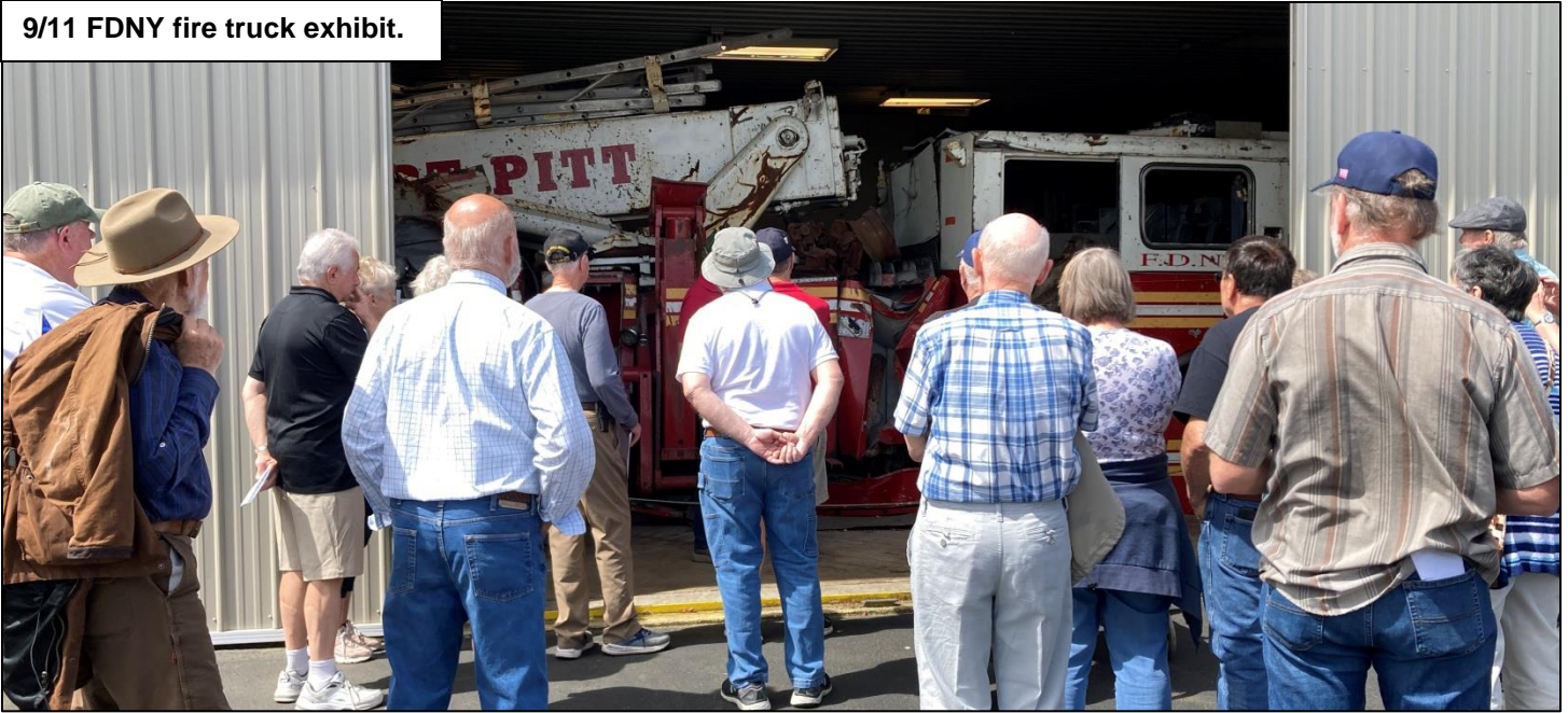
9/11 FDNY fire truck exhibit.