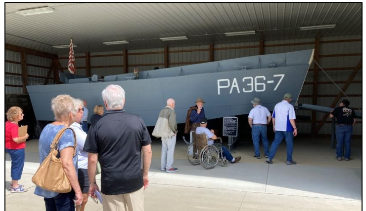
The Higgins Boat Display.